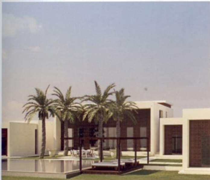
The development costs around US$250 million.